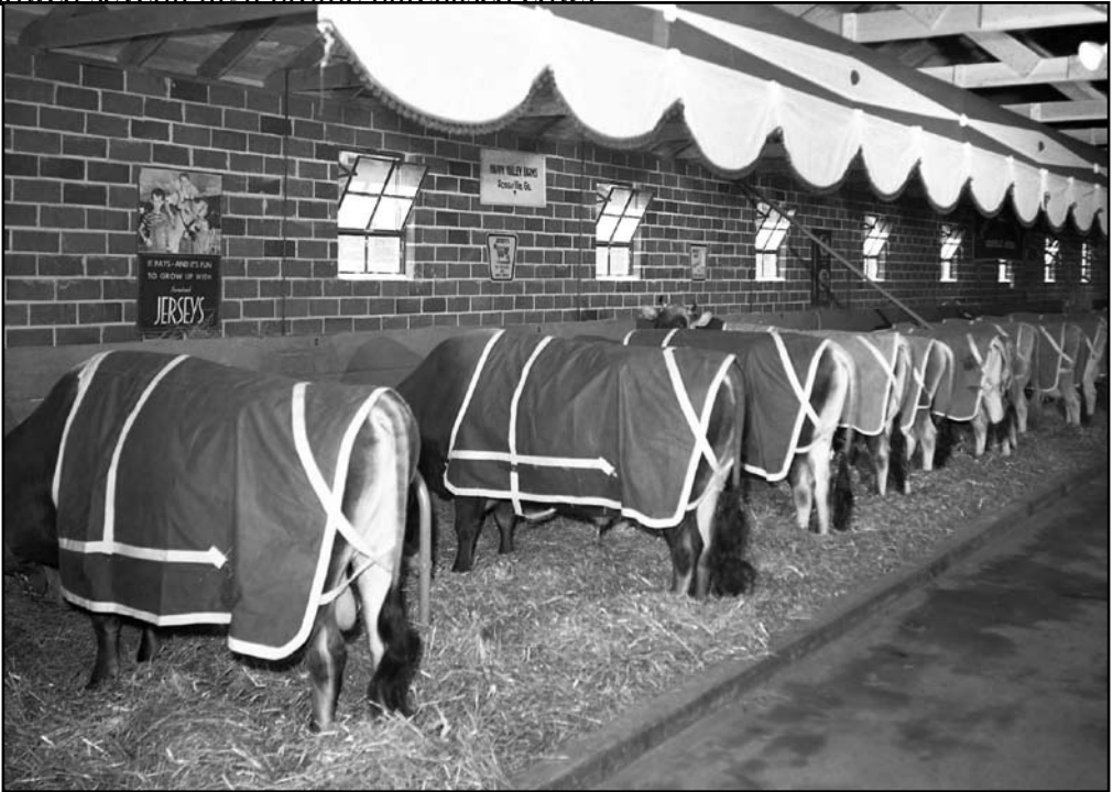
Happy Valley Farm, Rossville, GA

The Jersey show at the National Dairy Cattle Congress was not the National show most years but it was always a grand show with the premier herds attending from throughout the U.S. Three of the finest were Happy Valley Farm, Rossville, Georgia and Biltmore Farms, Asheville, North Carolina and Harmony Farms from Connecticut . All three herds were owned by people of means with Happy Valley and Biltmore showing mostly homebred cattle while Harmony showed several high profile purchased cows